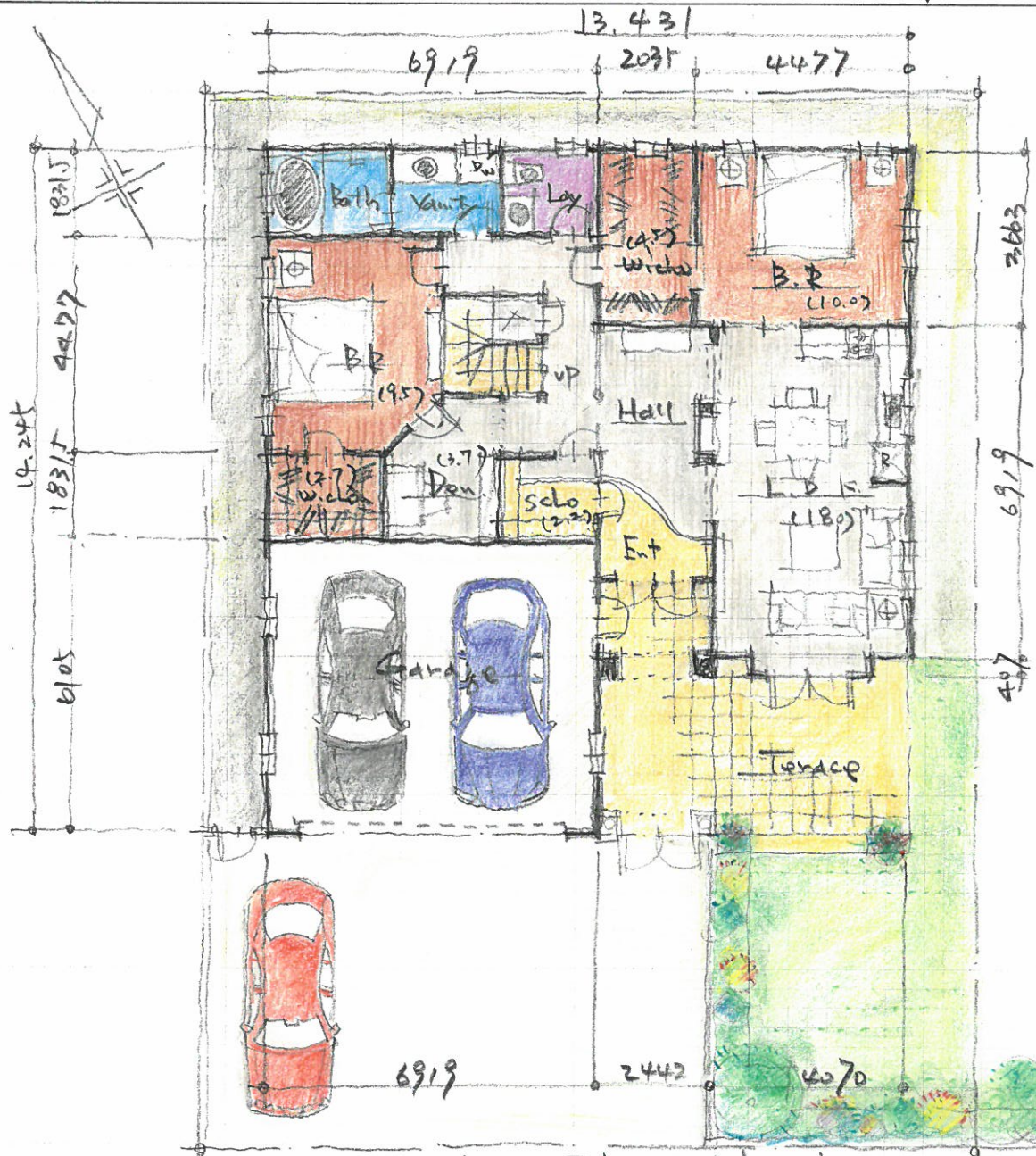
1st Floor Plan 1/100