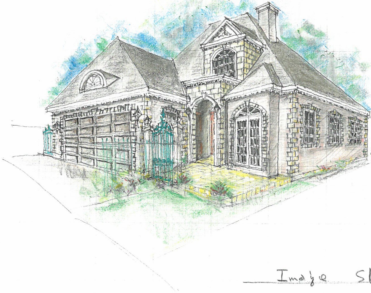
Image Sketch N/S.