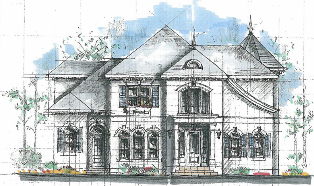
East (Front) E.l. 1/100