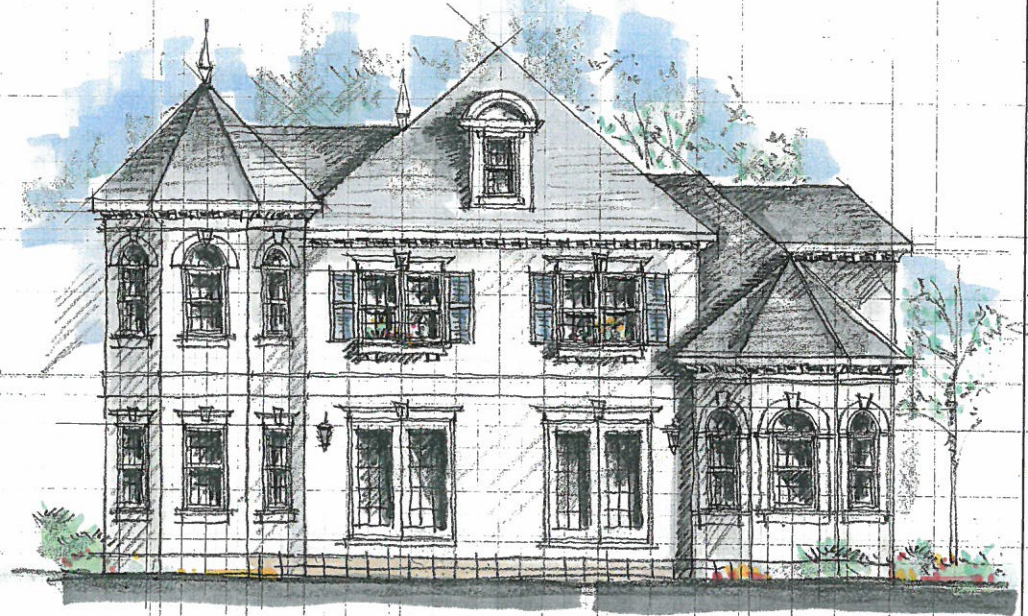
West E.l. 1/100